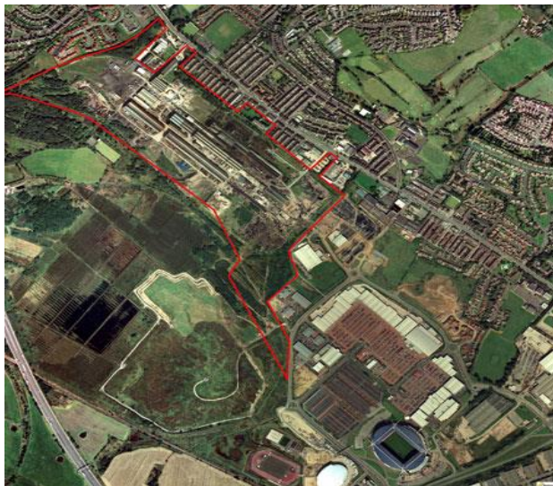
An aerial photograph of the old Locomotive Works in Horwich.