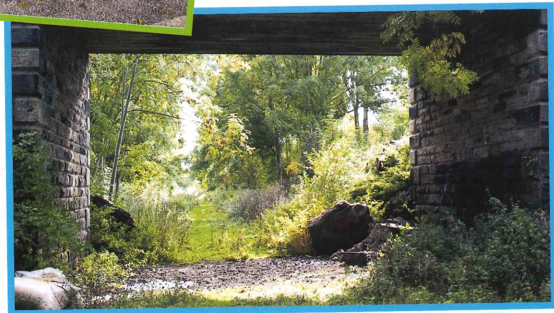
Disused railway lines like this are often popular with walkers.

The family rejoin the A61, then turn right into a quiet country road. They stop for a snack by a disused railway line . Then they return to the main road and continue on their way.